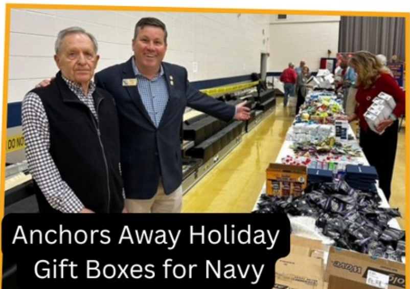
Anchors Away Holiday Gift Boxes for Navy