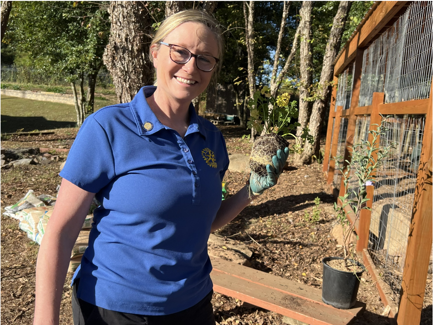
Posted by Whitney Higdon November 9, 2025