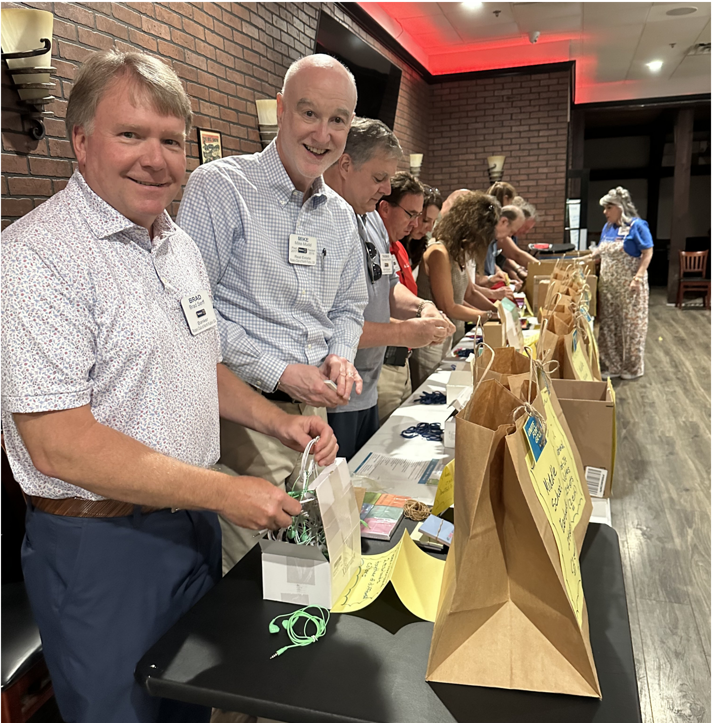
Posted by Lisa Gelber July 27, 2025