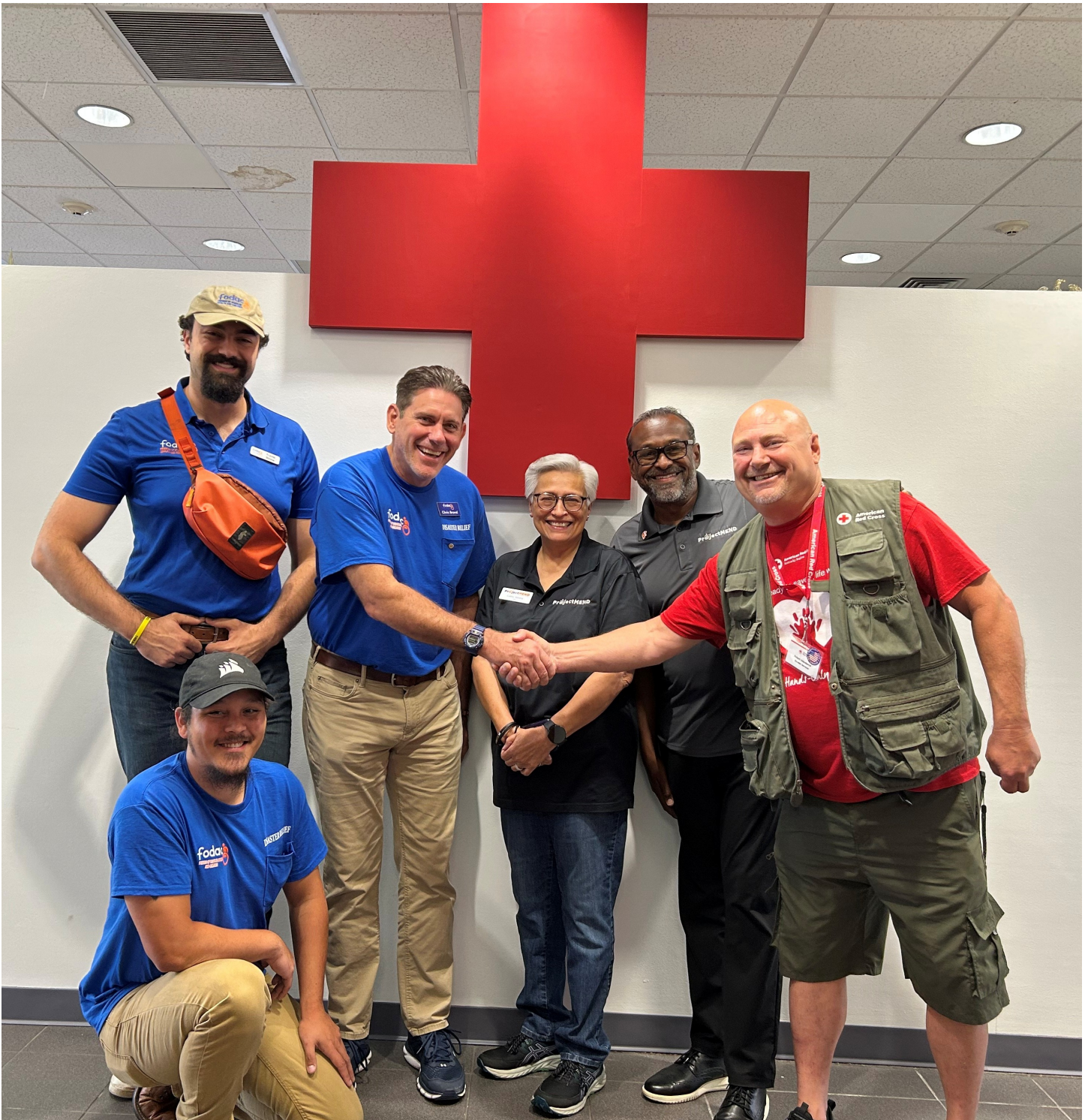
Posted by Nicholas Ramey July 27, 2025