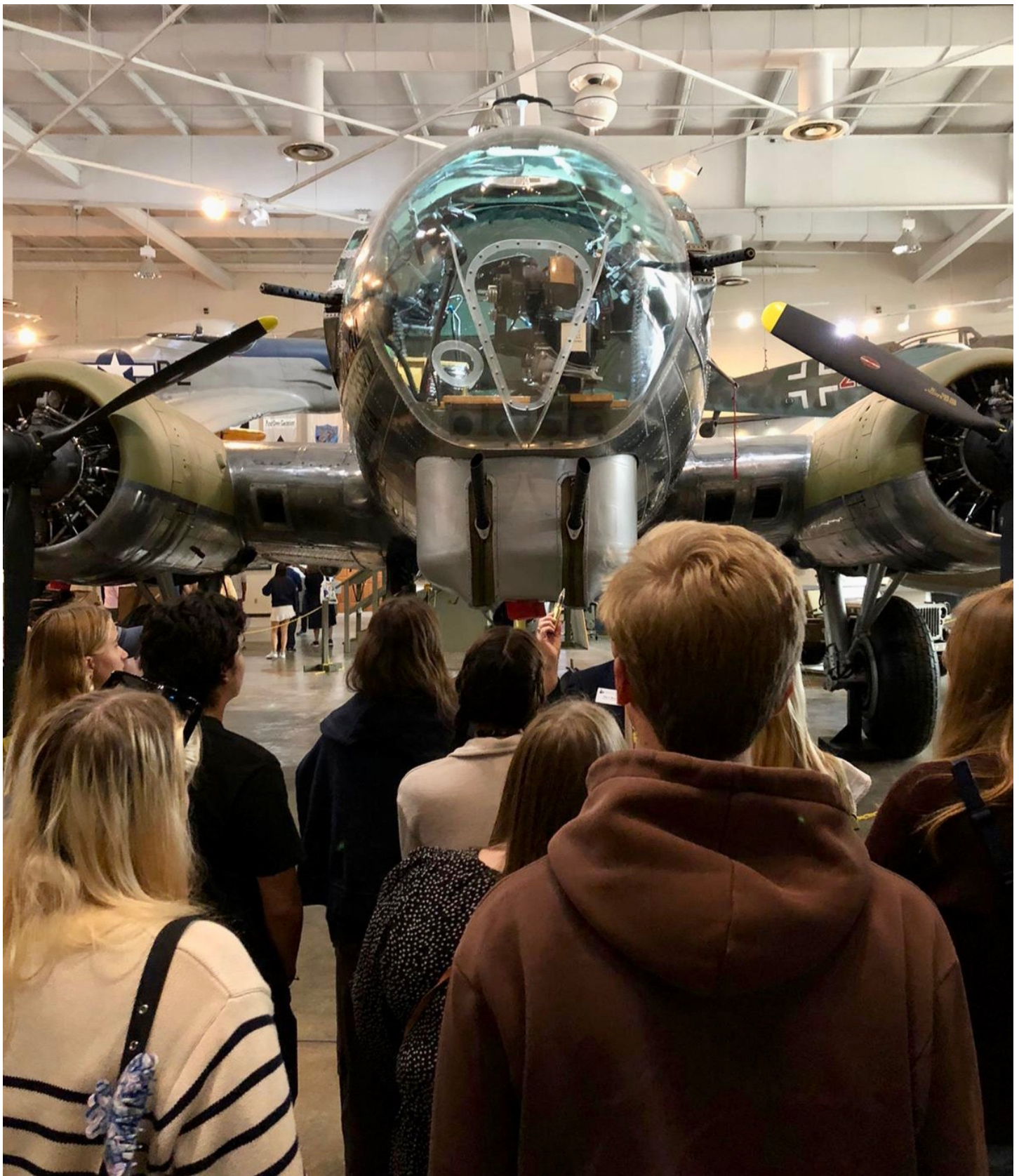
Posted by Katheryne Fields October 30, 2023