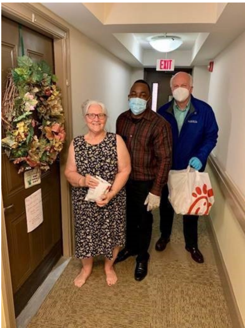
Posted by Christopher Bethel June 1, 2020