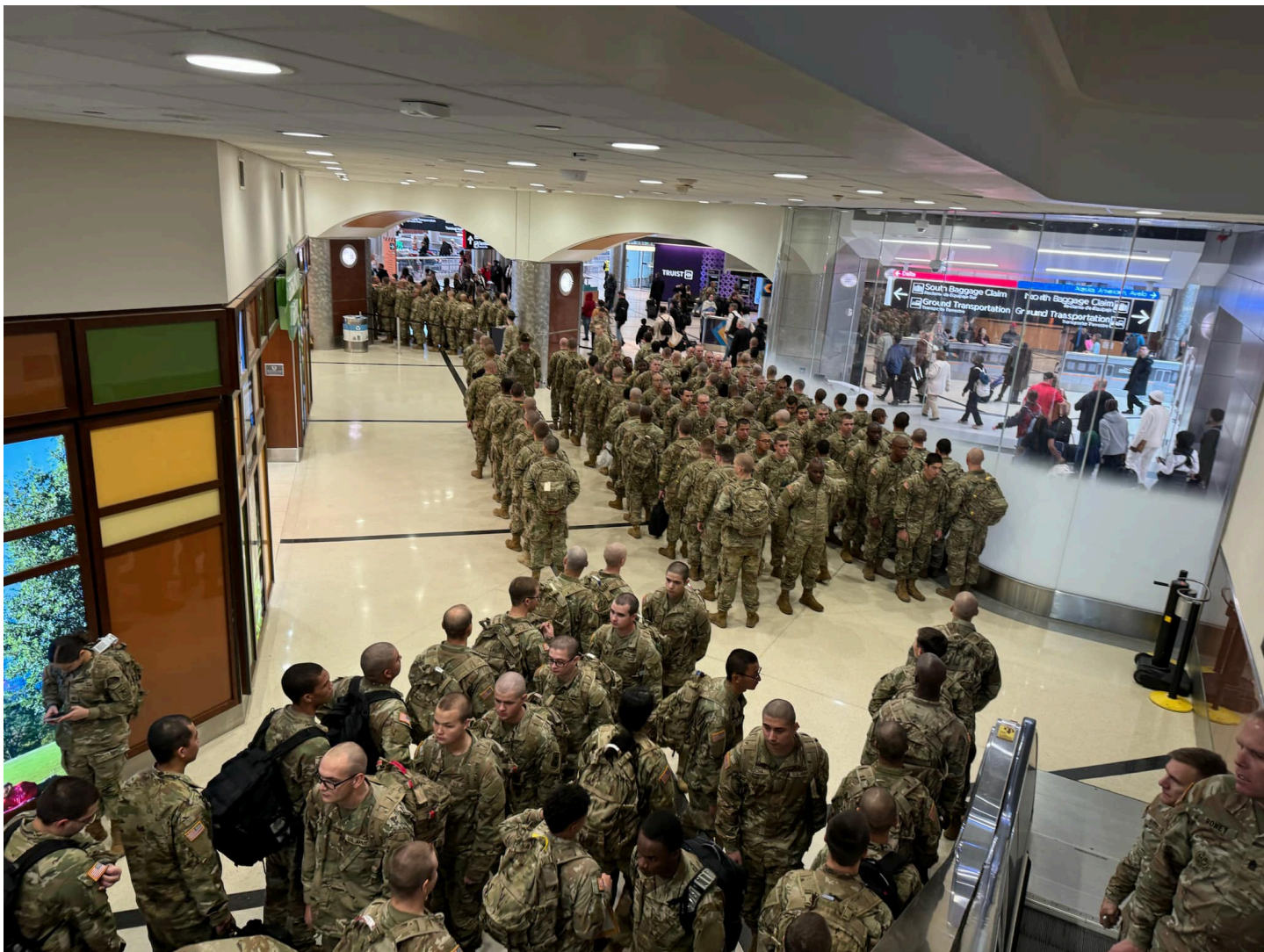
Posted by Roy Strickland April 2, 2025