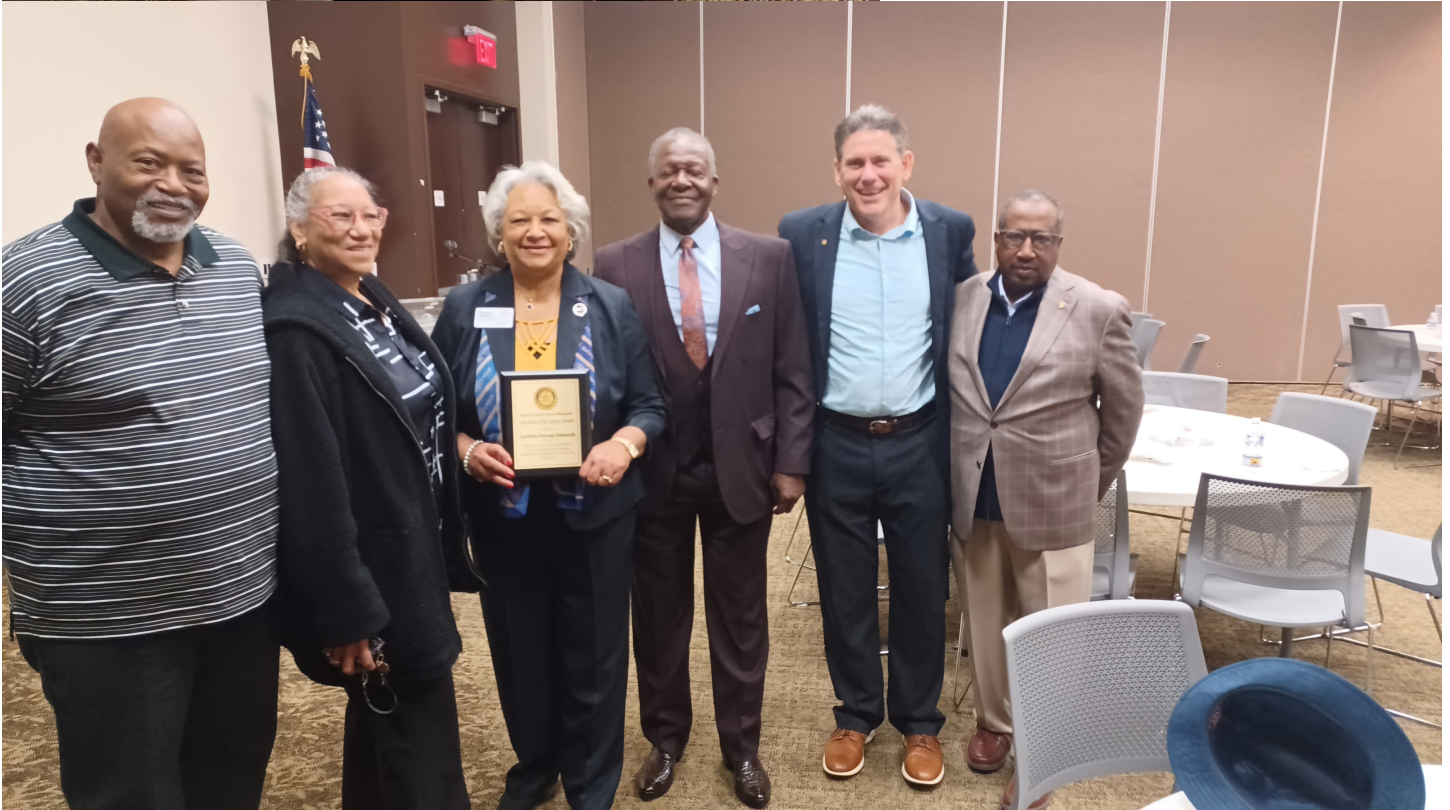
Posted by Darlene Daly April 2, 2025