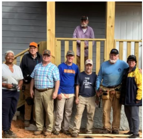
Posted by Janice Wallace January 3, 2025