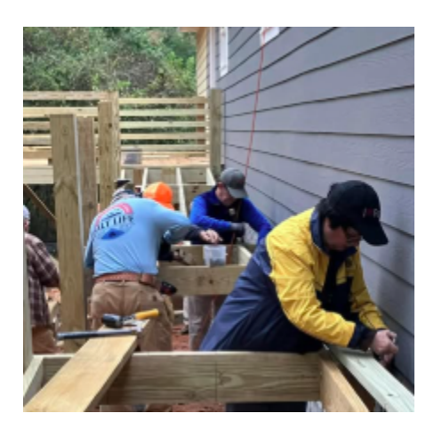
The Rotary Club of Griffin has utilized a Rotary District Competitive Grant to construct a few