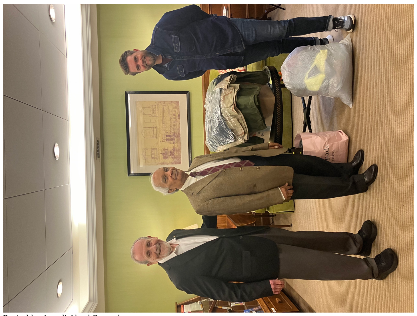
Posted by Angeli Abrol Duggal January 3, 2025