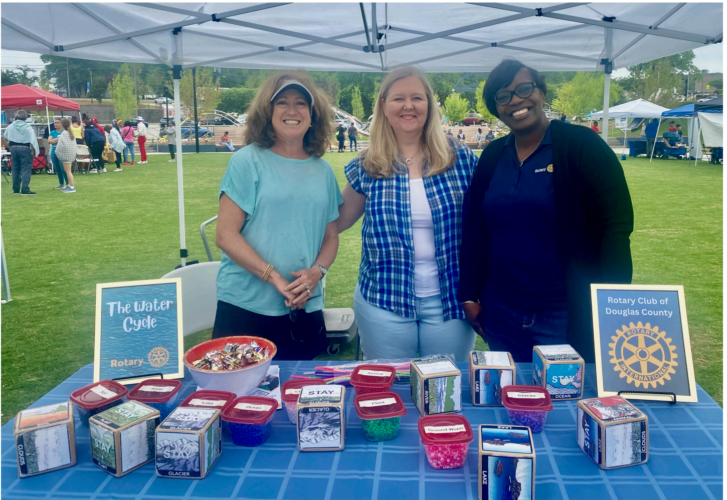
The Rotary Club of Douglas County joined in the Earth Day event at Douglasville's new Town Green! Kids young and old had fun making bead bracelets and learning about the water cycle.