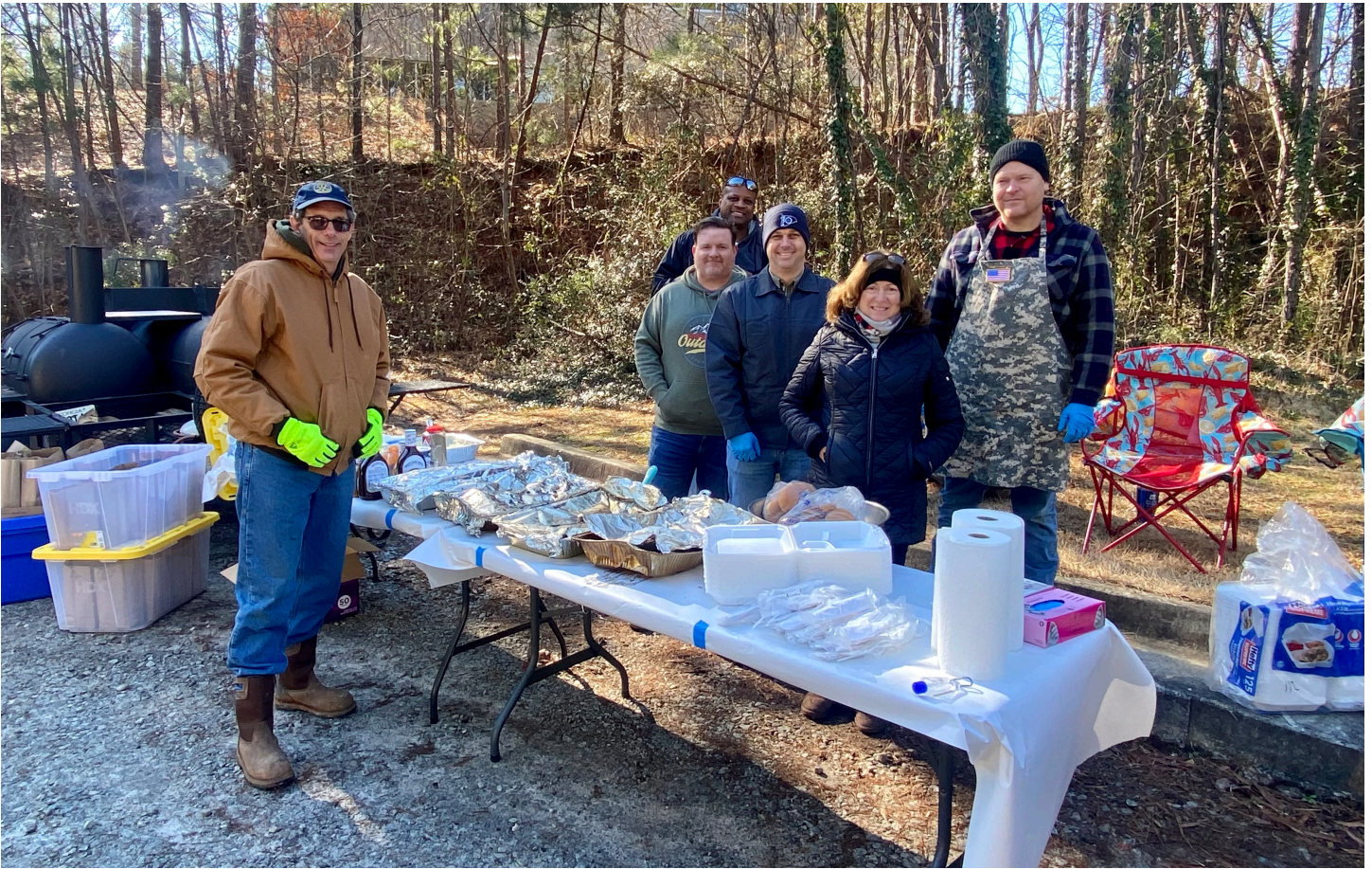
Posted by Nell Boggs March 27, 2023