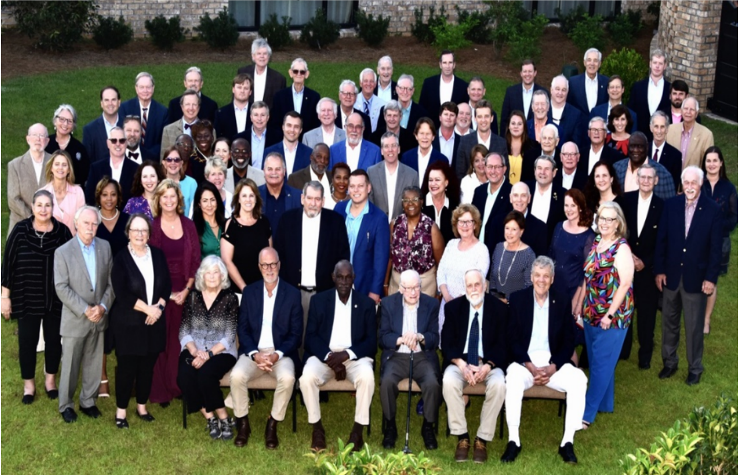
The Rotary Club of Thomasville was officially launched in the first week of May 1921. Exactly 100 years