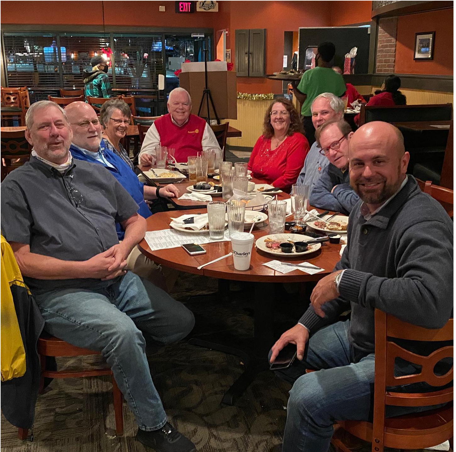
Posted by Kirk Driskell December 2, 2020